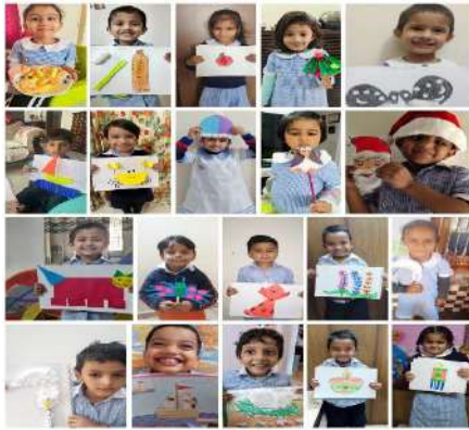
L.K.G. – SHOW AND TELL